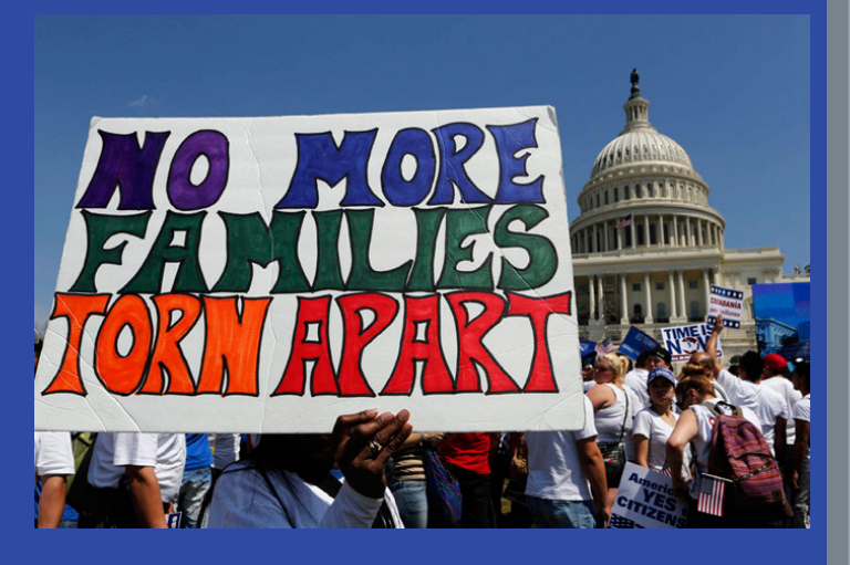
People protest about the unfair immigration system.