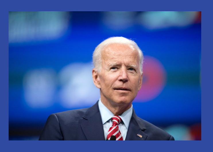
Biden gives a speech about the immigration system.